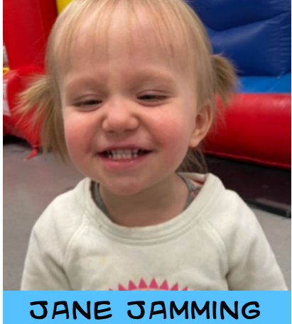
HER SUNBEAM SMILE