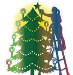
Help Us "Spruce" Up the Church!

The Greening of the Church will take place after worship on Sunday, November 26th . Many hands are needed for this decorating of the sanctuary, the foyer and Fellowship Hall. Hope to see you!