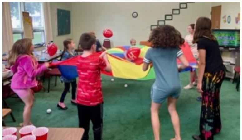
Fun On The Final Day Of Church School For The Year