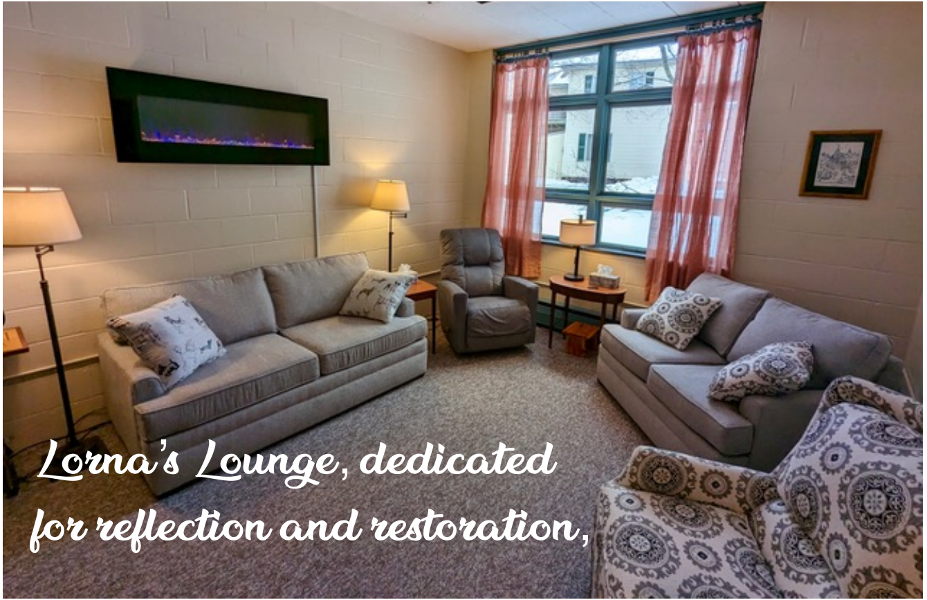
Lorna's Lounge, dedicated for reflection and restoration,