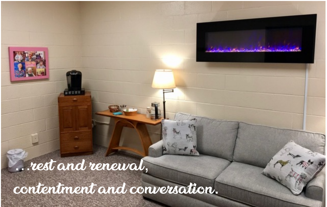
...rest and renewal, contentment and conversation.