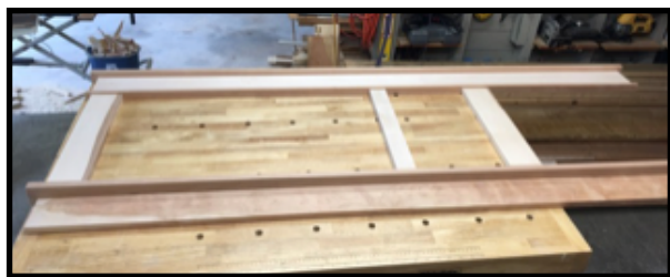
Cherry & Maple dimensioned for the window and door trim.