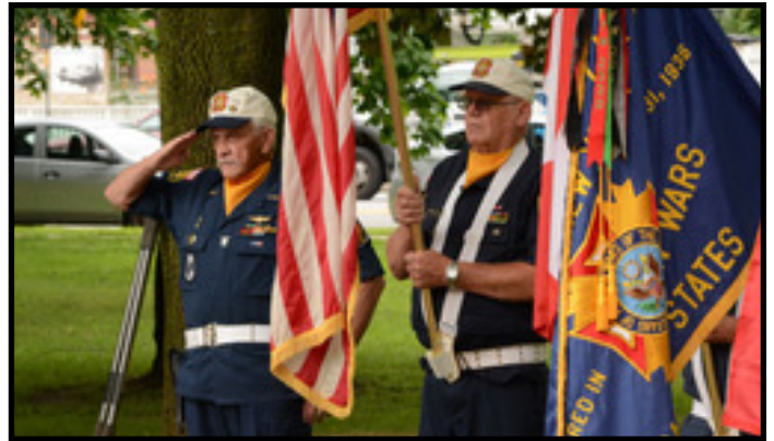
VFW Honor Guard at fountain opening.