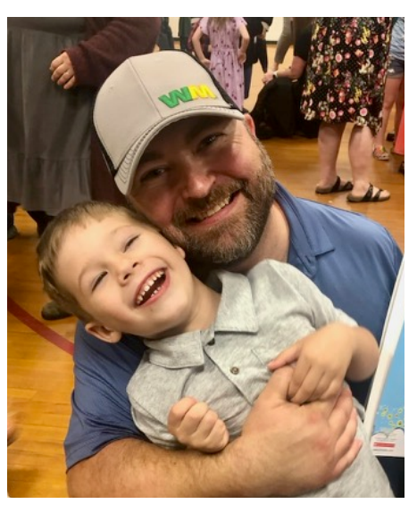
Lincoln Graduates Pre-K