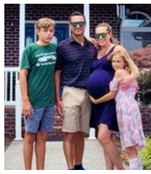
Trombly Family Expecting!