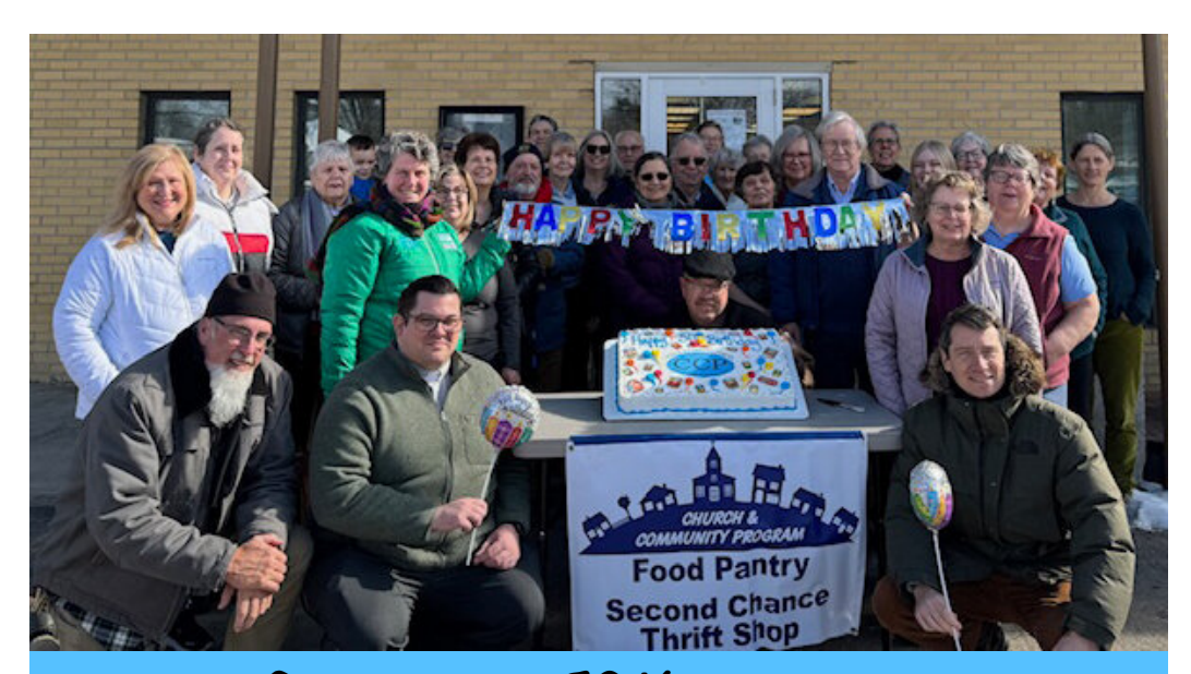
CELEBRATING 50 YEARS OF THE CHURCH & COMMUNITY PROGRAM!