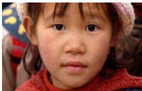
...and How are the Children? 2007 Conference • March 9-12 • Washington, D.C.

Since 2003 Ecumenical Advocacy Days has been an annual gathering of Christian partners, grounded in biblical witness and shared traditions of justice and peace. Through worship, theological reflection and opportunities for learning and witness, participants mobilize on a wide variety of U.S. domestic and international policy issues. This year participants from all over the United States will gather to focus on issues related to the health and well being of children. The eminent theologian Dietrich Bonhoeffer wrote that "the test of the morality of a society is how it treats its children." How we value and respect children – and whether we shape our public policies to bless their present and future – reflects who we are and the kind of world in which we want to live. Some scholarships may be available to assist those interested. For more information call the synod office or go to the Ecumenical Advocacy Days web page: www.advocacydays.org/index.php