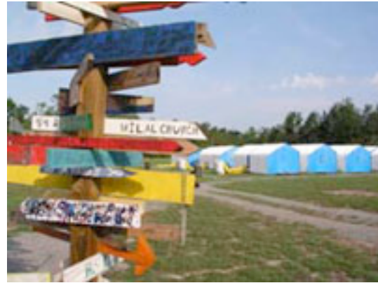
Teams came from many States

The most important element for both volunteers and homeowners was the human contact, and the need for the homeowners to tell their story of Katrina. A common theme heard was "thank you for being here."